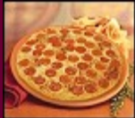
Best Pizza Contest